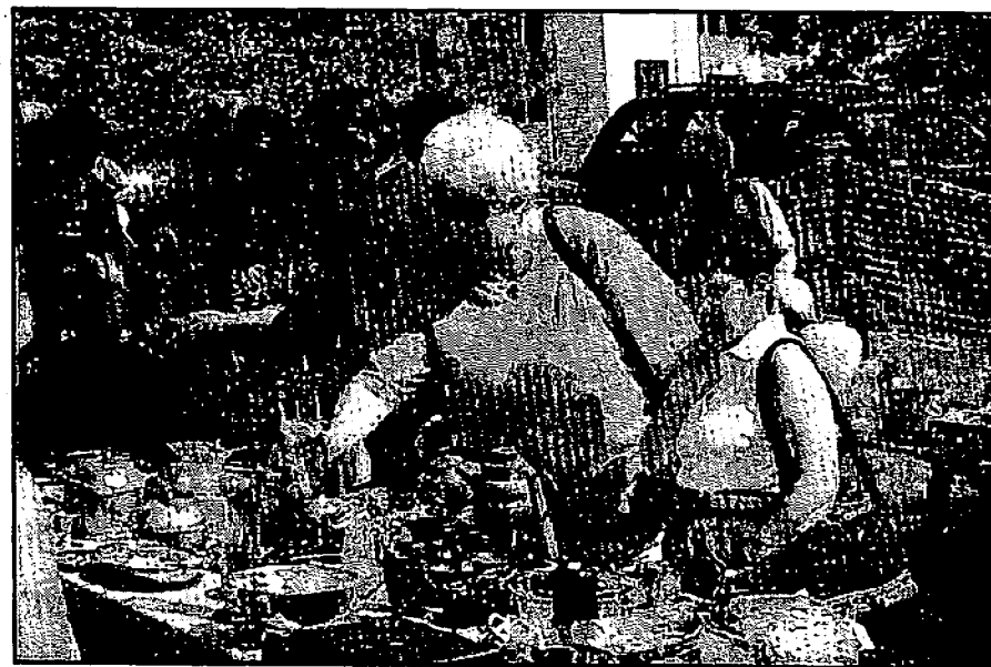
Great treasures were found on the sale tables.